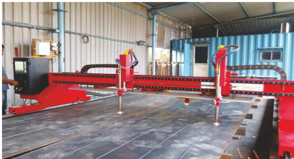
FLEXIGRAPH - Smart CNC Plasma / Gas Cutting Machine