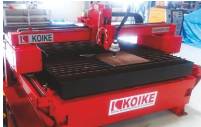
FLEXGRAPH-1530 CNC Plasma Cutting Machine