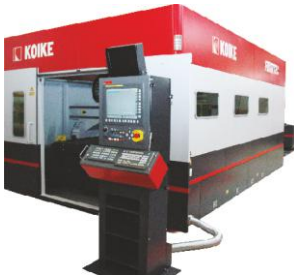
FIBERTEC-Z SERIES 2KW/5KW Fiber Laser Cutting Machine