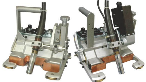
WEL-HANDY MULTI II Series Heavy-Duty Multi Purpose Mechanized Welding Carriage